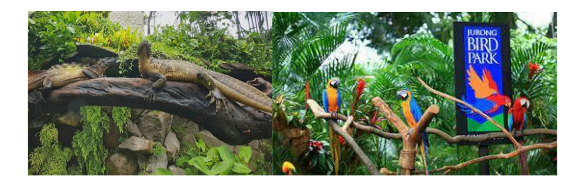
Bali Reptile Park